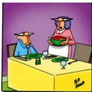
“I didn’t want to waste the good stuff, so I used the oldest bottle in your wine collection for the spaghetti sauce.”